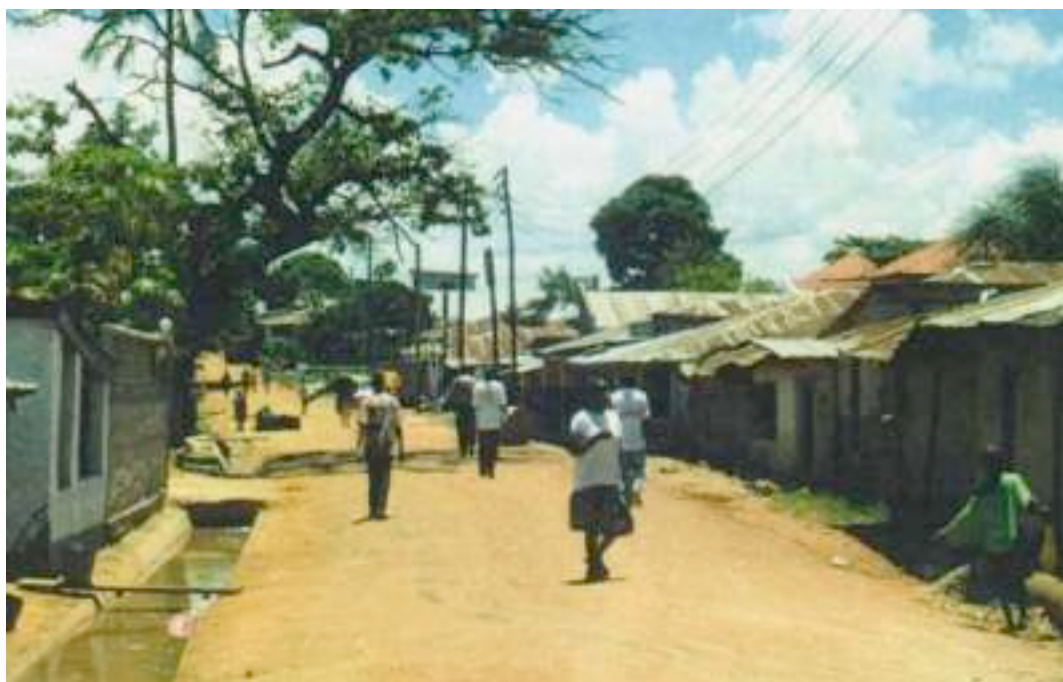
Completed murram roads and side drains. Side drains show lack of maintenance