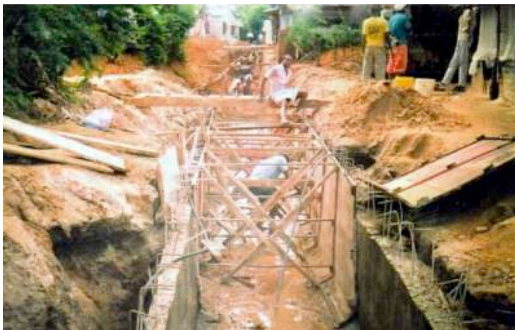
Construction of the main storm water drain