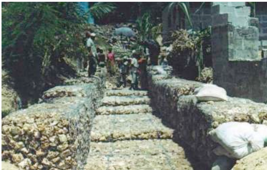
Construction of the main storm water drain by gabions