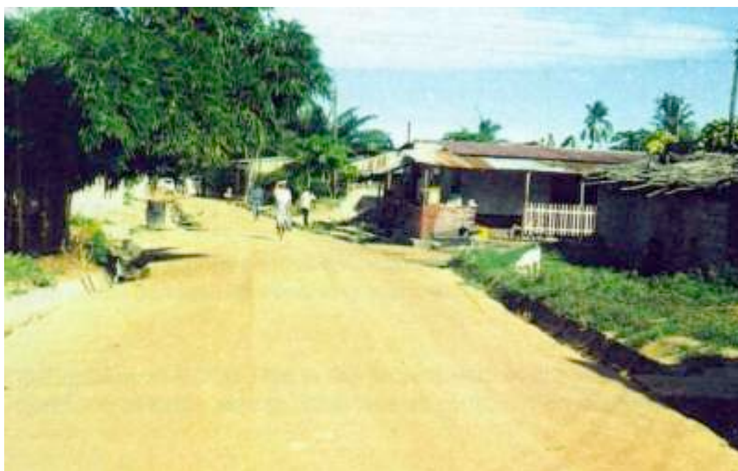
Completed murrum road