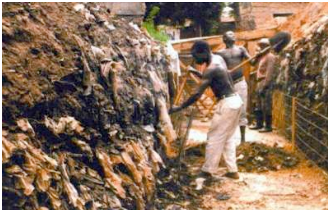
Excavation of the main drain through garbage depot